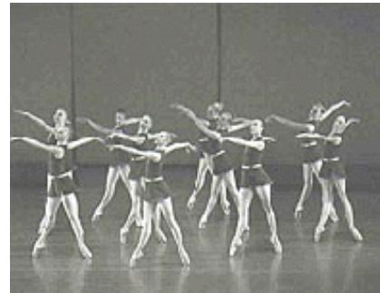
NYCB in Christopher Wheeldon's Mercurial Manoeuvres

At a press conference on April 24, just preceding the start of NYCB's Spring Season, the Company announced plans to raise more than $50 million, NYCB's first formal capital fund-raising effort and the largest such campaign in dance history. The Campaign for New York City Ballet will primarily raise endowment funds, helping to ensure that the Company's legacy of works by George Balanchine and Jerome Robbins are preserved, with Peter Martins' words, the "uncompromising commitment to excellence that remains at the Company's heart." The lead gift, of million, pledged by The Irene Diamond Fund, is being used to establish the New York Choreographic Institute, which will provide both new and experienced choreographers the chance to experiment and work with dancers without the pressure of preparing a performance, as well as offering symposia about choreography. "We want to give choreographers a supportive place to work, free from the pressures associated with commissions" says Martins, who developed the idea. The endowment campaign will also focus on other initiatives, including an archive of historical materials, more national and international touring, and the creation of an Artist in Residence program. Christopher Wheeldon, a NYCB soloist who retired from dancing at the end of the spring season, has been selected as the first Artist in Residence and will create two new ballets during the 2000-2001 season.