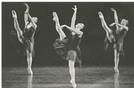
NYCB Ensemble in Opus 19/The Dreamer Choreography by Jerome Robbins

NYCB's dedicated volunteers continued to provide invaluable service to the Company. Volunteers were most visible at performances, staffing the information tables and the Gift Shop, assisting with Green Room receptions for NYCB donors, and leading docent activities for audience members. In addition, many individuals made contributions that were largely unseen, though much appreciated. Volunteers provided regular administrative help to the Company's development and special events departments and assisted the marketing department in sales campaigns by writing short descriptions of ballets in the repertory. Others processed rehearsal visit requests and helped manage NYCB'S ticket donation program.