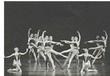
NYCB Ensemble in Bach Concerto V Choreography by Peter Martins