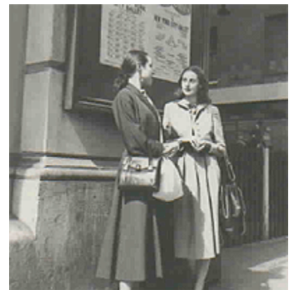
Maria Tallchief and Tanaquil Le Clercq outside London's Covent Garden theater in 1950