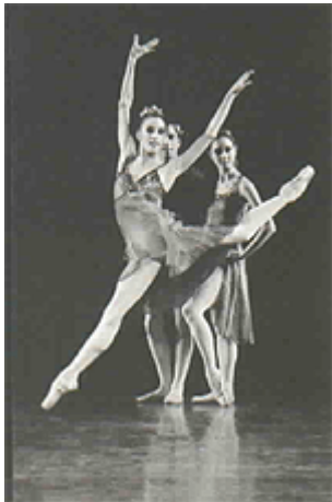
Wendy Whelan in The Four Seasons Choreography by Jerome Robbins