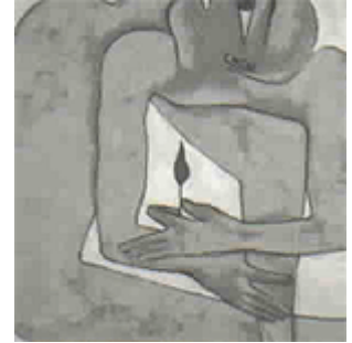
New York Choreographic Institute's logo designed by Francesco Clemente