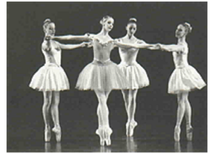
NYCB Ensemble in Viva Verdi Choreography by Peter Martins

and Symphony in C and Robbins' Dances at a Gathering , all enthusiastically received by the sold-out Festival audiences.