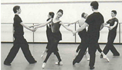
Students from The School of American Ballet perform a new work by Damian Woetzel