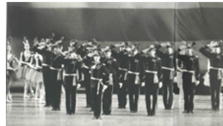
NYCB Ensemble in Stars and Stripes Choreography by George Balanchine © The George Balanchine Trust

New York City Ballet's 2001-2002 winter season began with a special Opening Night program on November 20, 2001—"A Tribute to the Spirit of New York"—as the Company sought, following the events of September 11, to show its appreciation to the city and its people, and most especially its loyal audience. The program featured Serenade , "The Man I Love" pas de deux from Who Cares? , and the rousing and moving finale from Stars and Stripes . Wynton Marsalis made a surprise appearance, improvising on "America the Beautiful" and adding a trumpet obligato to "The Man I Love." A portion of the proceeds from the benefit, which was sponsored in part by Forest Laboratories, was donated to The Children's Aid Society to assist those displaced by the World Trade Center tragedy, in keeping with the Company's longstanding commitment to the education of children in New York.